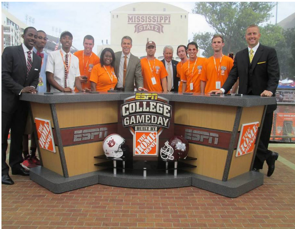
Mississippi State students with the College Gameday personalities.

people who work for Gameday Continued on page 3